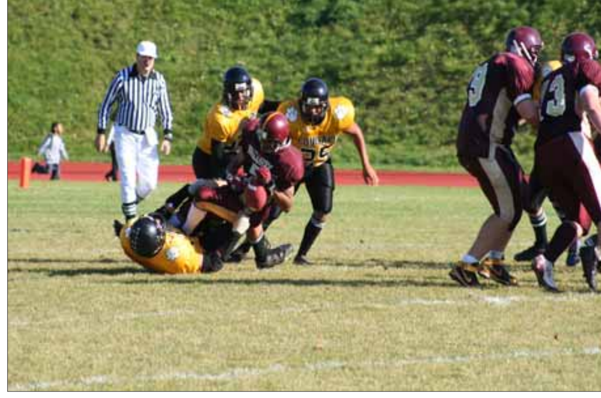
The Vicenza Cougars defense kept the Baumholder Buccaneers to short yardage most of the game.

As second half play resumed it started much the same with the Cougars stopping the Buccaneers and getting the ball back for a great drive down to the 12-yard line. On the Cougars next play, a run by