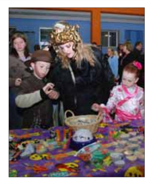
Community members wearing a variety of costumes at the Halloween carnival from Medusa, to Indiana Jones and an Oriental princess.